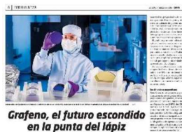
Grafeno, el futuro escondido en la punta del lápiz

Article about the SPRING project: “Grafeno, el futuro escondido en la punta del lápiz” Newspaper article, GARA science journal, 29.05.2020